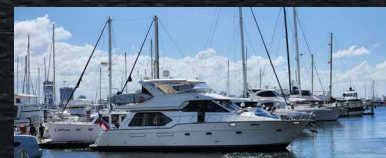
POWER BOAT EVENTS