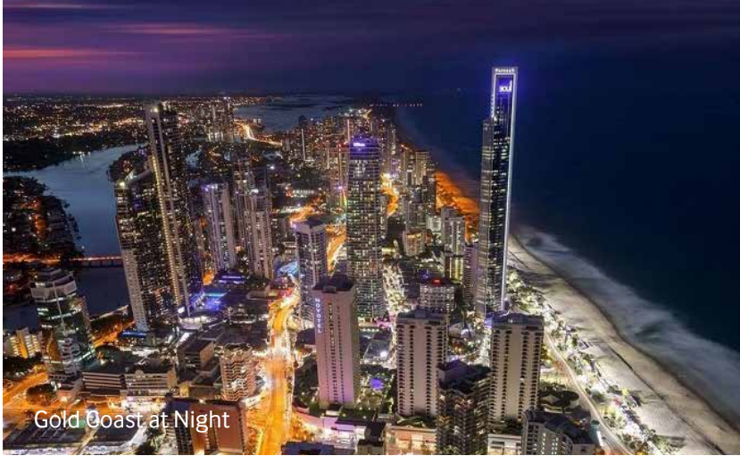
Gold Coast at Night