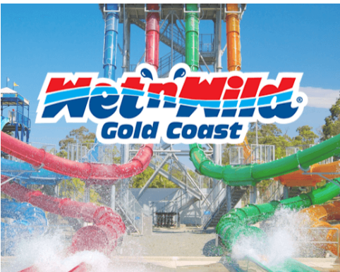
WET 'N' WILD