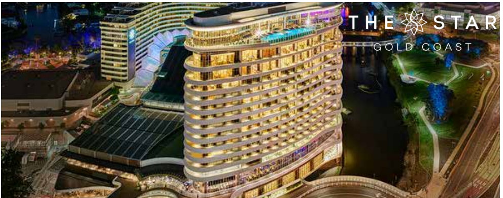
THE STAR CASINO